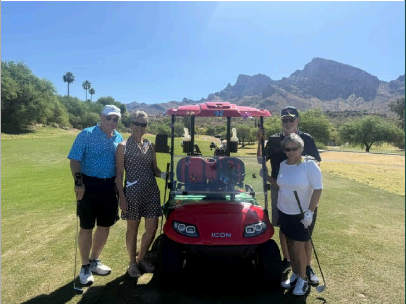
The picture above was taken at our May 2026 closing tournament.